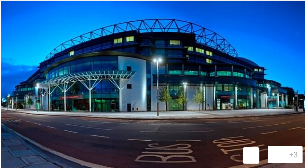
Twickenham might be the home of England rugby, but it will hold a very different kind of event