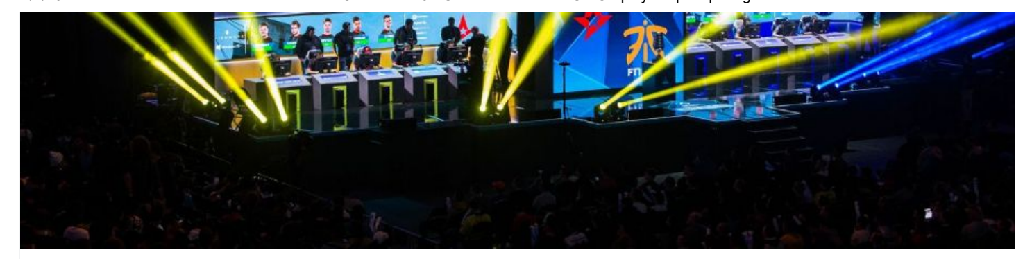
Astralis and Fnatic clinched their EU ESC playoff spots in Week 7, along with FaZe Clan. One spot remains open with a week left in the regular season.